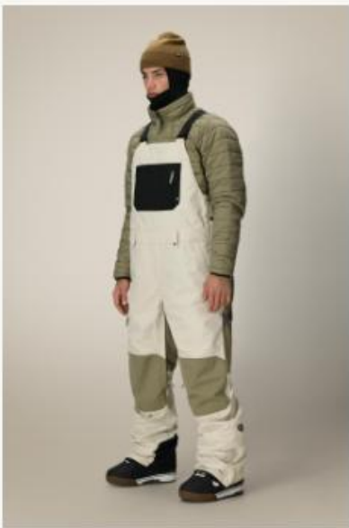
Model is 6'0", Waist: 31 in. in a size Large