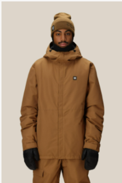
Model is 5'11", Waist: 30.5 in., Chest: 30.5 in. in a size Large