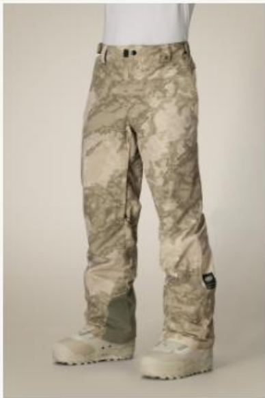
Model is 5'11", Waist: 30.5 in wearing a size Large