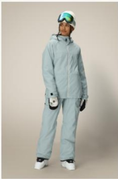
Model is 5'8", Waist: 27 in. in a size Small