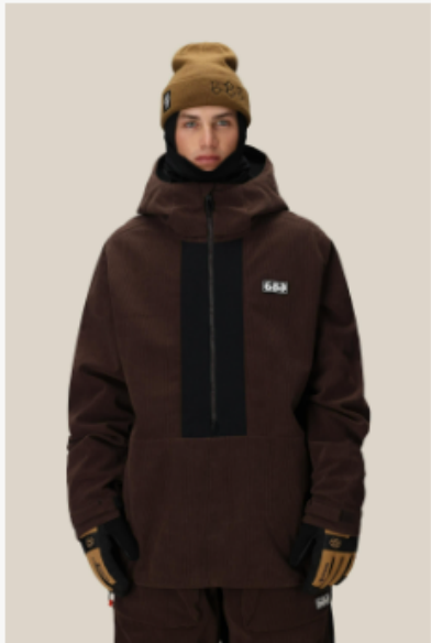
Model is Height: 6' 1" (186cm), Chest: 38" (97cm) in a size Large